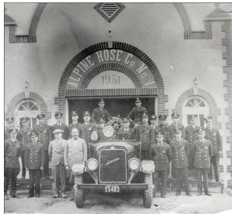
Over the years the community changed and

The original Alpine Firehouse was located on Miles Street. In 1962, the Reliance Fire Company was formed with 15 members and the department was moved to a garage behind the borough hall that was at the site of the current firehouse at 94 Church Street. In those days, Alpine was a smaller, close-knit community of mostly dirt roads and tiny wooden homes.