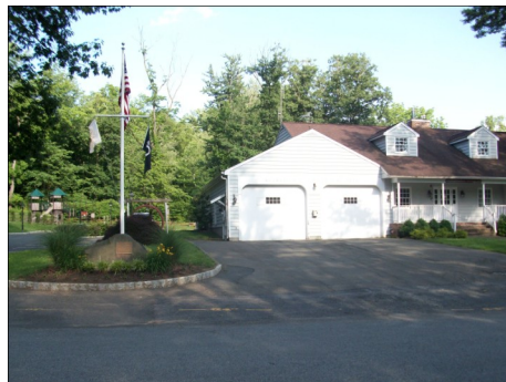
Fire Department Today

A unique aspect to fire fighting in Rockleigh Borough is the "Day Brigade." Unofficially formed in the 1950's and formalized in 1964, the Day Brigade is composed of volunteers from firms that make up the Rockleigh-McBride Office and Technical Park. When fire coverage became a problem because of the number of Rockleigh residents who worked outside the borough during the day, employees of Astral Industries and Carlee Corporation volunteered their services for fire duty during the daylight hours. The Day Brigade is a vital bridge that