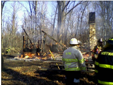
Cabin Fire in Nov. 2008

The company of 30 volunteers respond to roughly 150 calls a year. Half of the borough's fire calls are from automatic fire alarms and the others range from oven fires to car accidents.